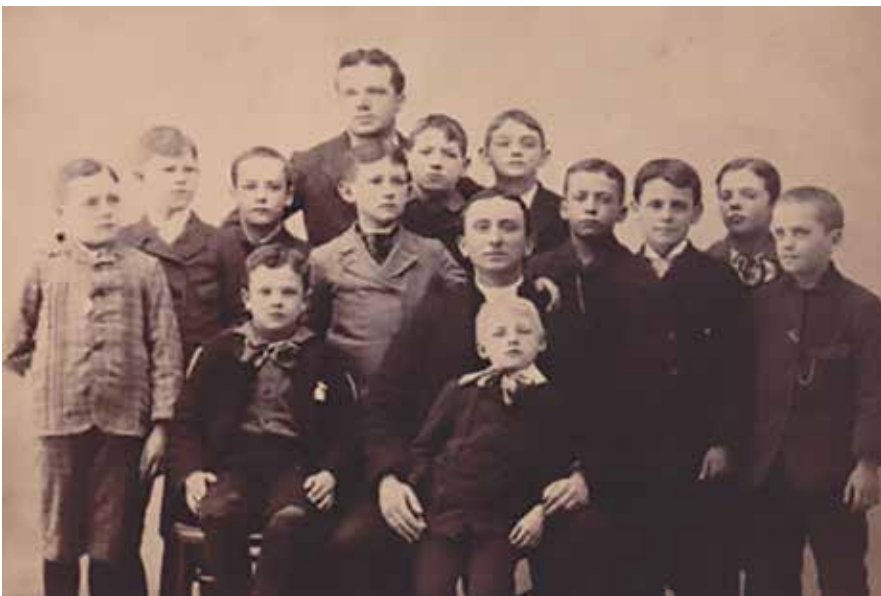
Left The first graduating class of Hoosac School.